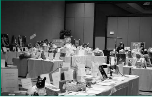
Readying the Silent Auction