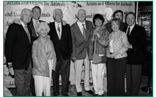
Monty Hall, Charlotte Rae, Earl Holliman, Dick Van Dyke, Dick Martin, JoAnne Worley, Nancy Dussault, Gary Owens, Steve Lawrence