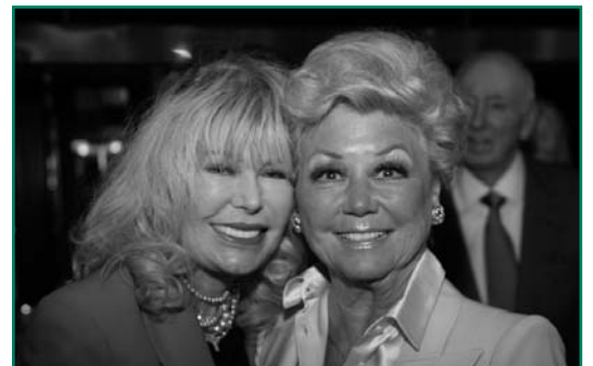
Loretta Swit, Mitzi Gaynor