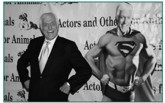
Dick Van Dyke and "Super Dick" his superhero alter ego

Over $200,000 was raised during this afternoon of fun to help Actors and Others continue to bring spay/neuter services to the animals of the greater Los Angeles area.