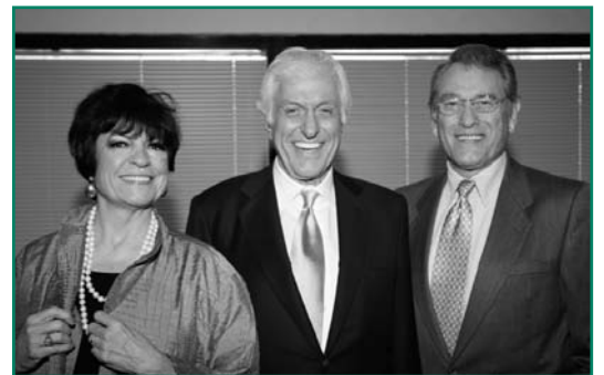
JoAnne Worley, Dick Van Dyke, Earl Holliman